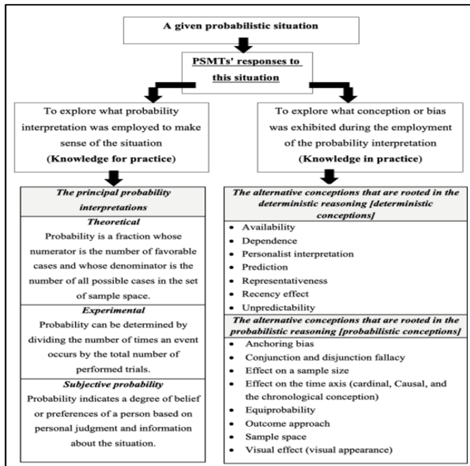
Figure 2. Essentials to characterize mathematics teachers' knowledge for teaching probability

Accordingly, probabilistic reasoning differs from deterministic reasoning that (i) leads to looking at one definitive answer and (ii) seeks for a correlation using present and past information to explain a phenomenon, where the dependency or causality still exists (Savard, 2010, 2014; Shaughnessy, 1992). On the contrary, in a probabilistic situation, (i) there is more than one possible outcome, (ii) the occurrence of an exact outcome is unpredictable, and (iii) the sequence of obtained results lacks a pattern; it cannot be controlled or predicted, and the only thing to be done is to critically choose the event most likely to occur (Tsakiridou & Vavyla, 2015). This satisfies Borovcnik and Peard's (1996) differentiation between logical reasoning that designates a proposition as valid or false and probabilistic reasoning where we have no complete certitude concerning a random event in the case of probability.