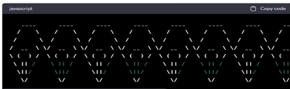
Figure 11. A picture used by ChatGPT to generate a correct solution (OpenAI, 2023)

While ChatGPT provided a correct response using pictures, the image generated was in JavaScript, as depicted in Figure 11 , which may be challenging to comprehend and require an additional application to produce an accurate image.